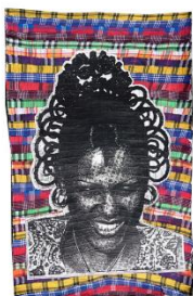
Fiene (FREETOWN series), 2016 Silkscreen, patchwork, sewing on canvas 54 x 37 inches 137.16 x 93.98 cm $900.00