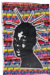
Jackie (FREETOWN series), 2016 Silkscreen, patchwork, sewing on canvas 54 x 37 inches 137.16 x 93.98 cm $900.00