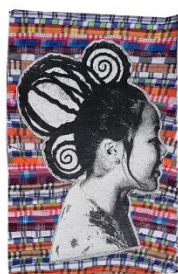
Irene (FREETOWN series), 2016 Silkscreen, patchwork, sewing on canvas 54 x 37 inches 137.16 x 93.98 cm $900.00