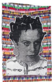
Alma (FREETOWN series), 2016 Silkscreen, patchwork, sewing on canvas 54 x 37 inches 137.16 x 93.98 cm $900.00